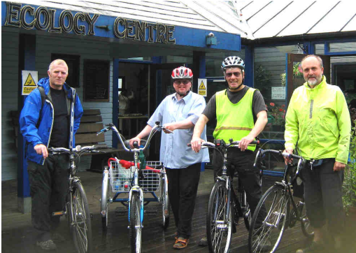
The Biodiversity Ride starts out