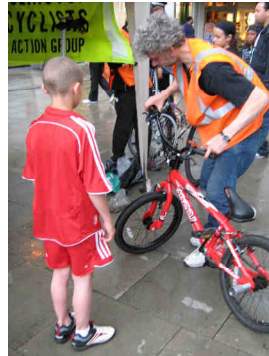
Dr. Bike at the N1 Centre