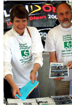
Information at Tour d'Arsenal