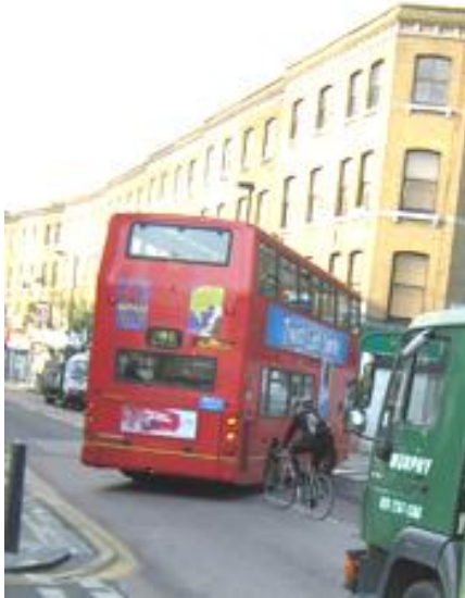
Turning right off Hornsey Road