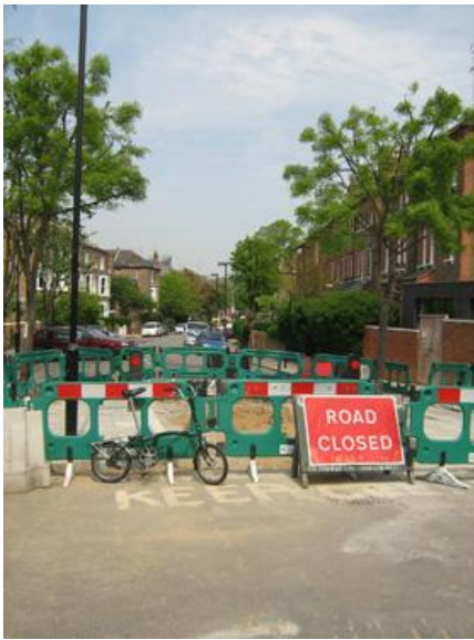
Work in progress Dalmeny Road