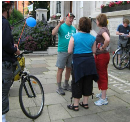
Briefing for the Quest