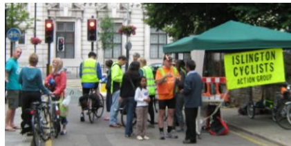
Madras Place Chill Down