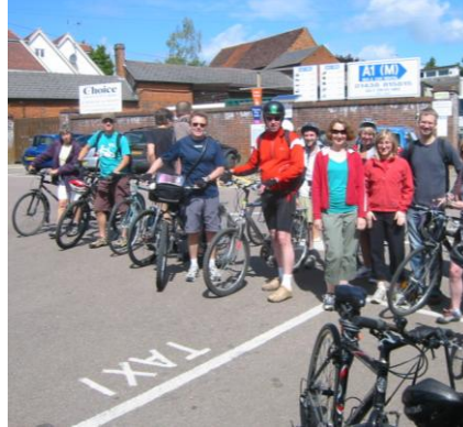
Little Green Ride