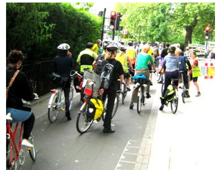
Cyclists queue to cross