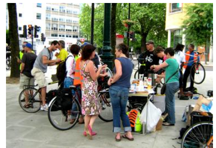
Breakfast at Goswell Road