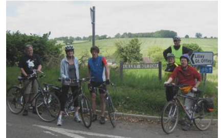
The little green ride