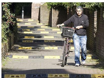
Before in Islay Walk