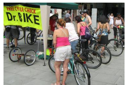
Queuing for a bike check