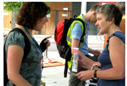
Questions were answered...