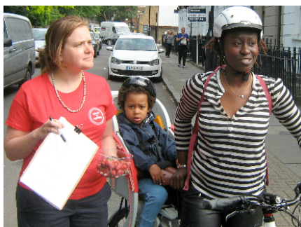
Petitioning on the Quietway route

Islington Council has secured money from TfL to build a cycling Quietway from Finsbury Park to Clerkenwell. The route is quieter than Holloway Road, but it is still heavily used by through traffic. We want the council to trial removing the majority of traffic from this route by only providing local access. After a 6-month trial and comprehensive traffic counts before and during, the council can make an informed decision about the proposal.