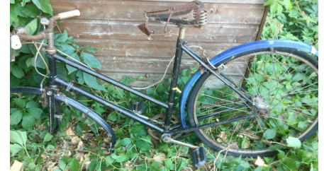
Old Raleigh in need of love

MEMBERS' MARKETPLACE Ladies' Raleigh Bike - needs good home and mechanic. This bike has been out in all weathers for the last 10 or so years, but the frame is in good condition, so it would be a shame to take it to the dump. Needs some replacement parts! Can deliver [free] in Islington. Contact 249keith@waitrose.com