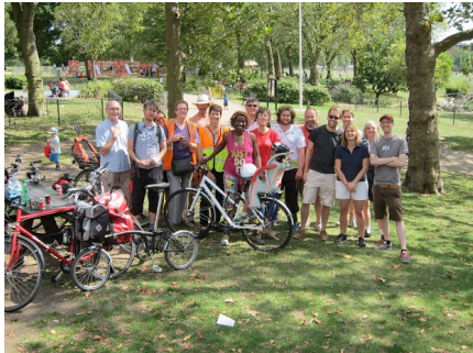
22 August, Cycle the Quietway Ride

Rides like this are a great way of meeting people and telling them about our campaigns. It would be good if we could organise a few more but to do so we need extra people to assist with the marshalling.