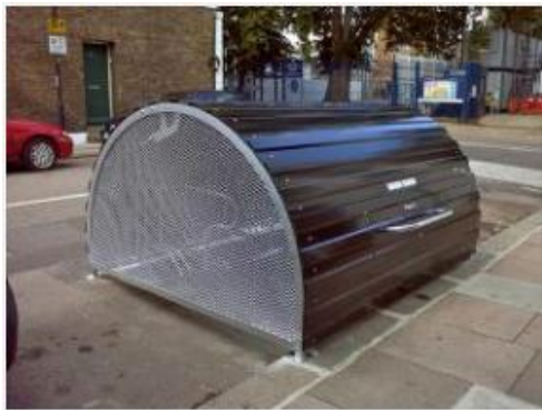
Bike Hangar: secure and covered on street cycle parking

With increased multiple occupancy of many houses and limited storage space in flats, many cyclists currently have to lock up their bikes outside with the inevitable worry about bike theft. Our neighbours in Hackney have hangers at a current cost £30/year plus deposit - and on our recent trip to Walthamstow, we were told that there will soon be over 60 in the borough at £12.50/bike/year. Lambeth led the way in 2012 and by 2013, had installed 27 hangars. There is currently a proposed pilot scheme in Islington for just two hangars in Crayford Road and Hamley Road. If you want a hangar in your street, start talking to your neighbours and your local councillors now – list of councillors: http://democracy.islington.gov.uk/mgMemberIndex.aspx