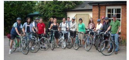
The Little Green Ride