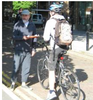
ICAG's bike breakfast

Sign up for Freewheel This years Freewheel has been rebranded Skyride and registration is through British Cycling. Keep Sunday 20 Sept free! We'll be leading a feeder ride – watch our website for details. Volunteers welcome! Register at http://new.britishcycling.org.uk/skyride/register?event=london