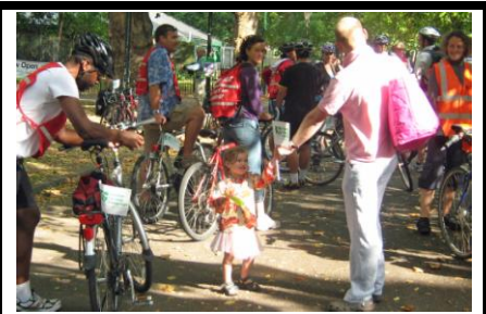
Getting ready to go on Freewheel 2007

Once more ICAG members were talking the talk at this long running festival. People were interested in the information and the leaflets we were able to give out.