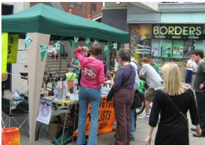
ICAG at the N1 Centre