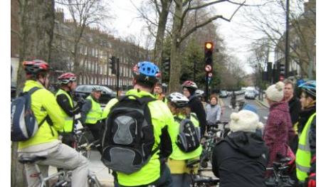
At the Goswell Road Triangle

One of our members stopped to buy some milk in Upper Street, locking her bike before going into the shop. On her way back to her bike she found a man tussling with the lock. She demanded, "Oi! What are you doing to my bike?" "Trying to steal it" he replied. He got onto his bike and went. Totally shameless!