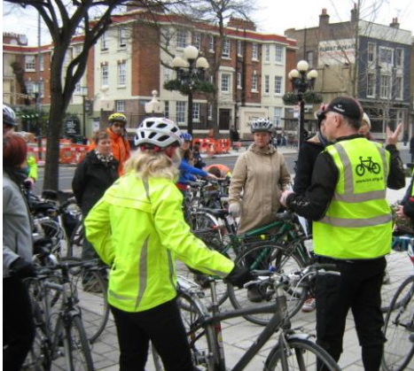
A few words before we go...