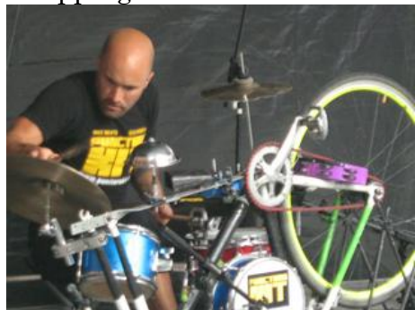
A drumming cyclist at the event

Turf, deck chairs and more spanned the road between Sainsbury's and the Angel Shopping Centre.