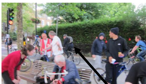
This cyclist is the Mayor! Some photos from the Cool Down - not on the website.