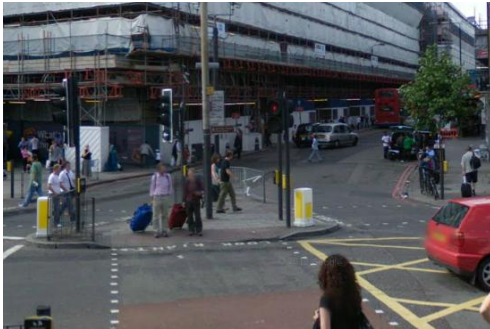
King Cross August 2008 (The side of the Station was being done up)