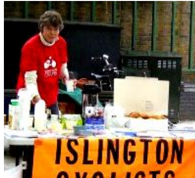
For Bike Breakfast!