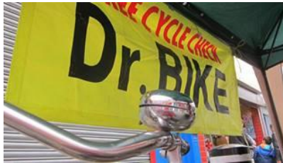
We were at the Chapel Street Farmers' Market