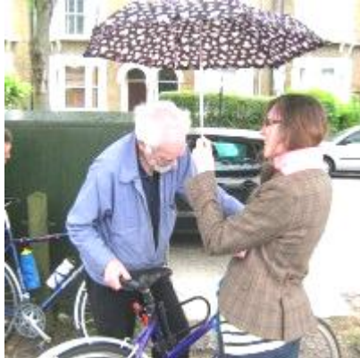
Bike Doctor at Tufnell Park Farmers' Market