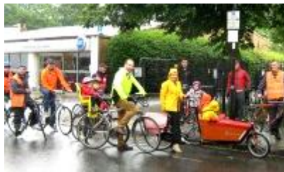
We rode the route for Tufnell Park Cycles to School