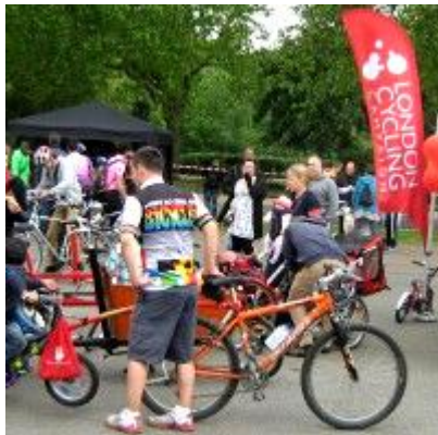
We were at Finsbury Park BikeFest on the Sunday