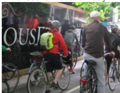
On the Tuesday we were at Goswell Road...