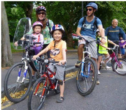
We ran a feeder ride to RideLondon FreeRide