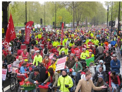
Mass demo for Go Dutch

We're thinking something on this scale would be good!